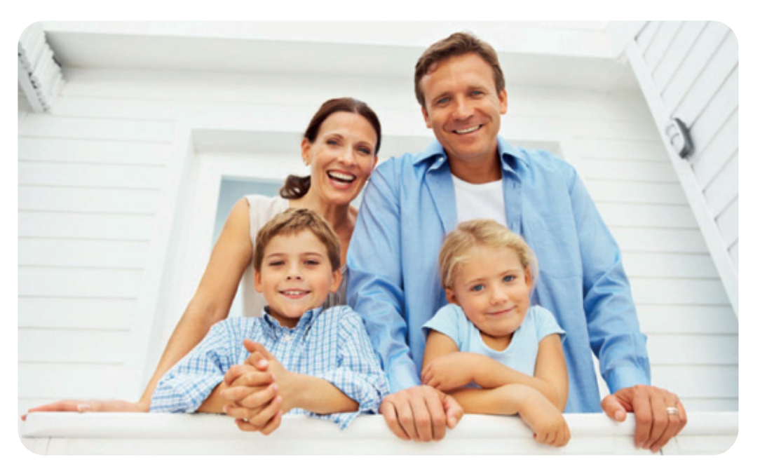
Hot Water, Powered by the Sun Delivered by Apricus